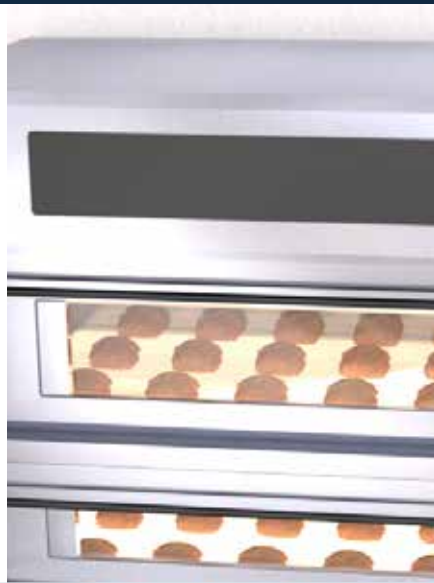
Heating and cooking equipment