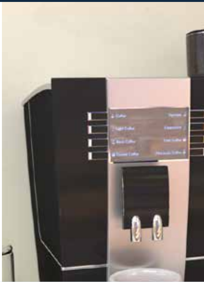
Coffee and vending machines